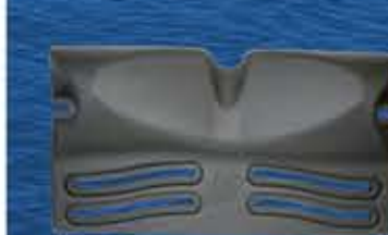
BOAT & PWC BOW GUIDES